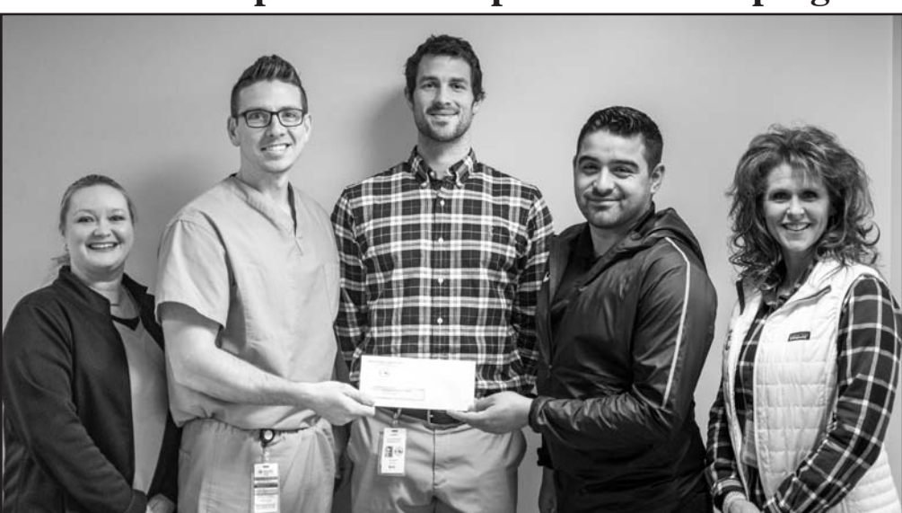
Representatives from UGH and MUSA met earlier this month.

Mountain United Soccer Association (MUSA) would like to thank Union General Orthopedics and Sports Medicine for their support of youth soccer. They will be our Premium